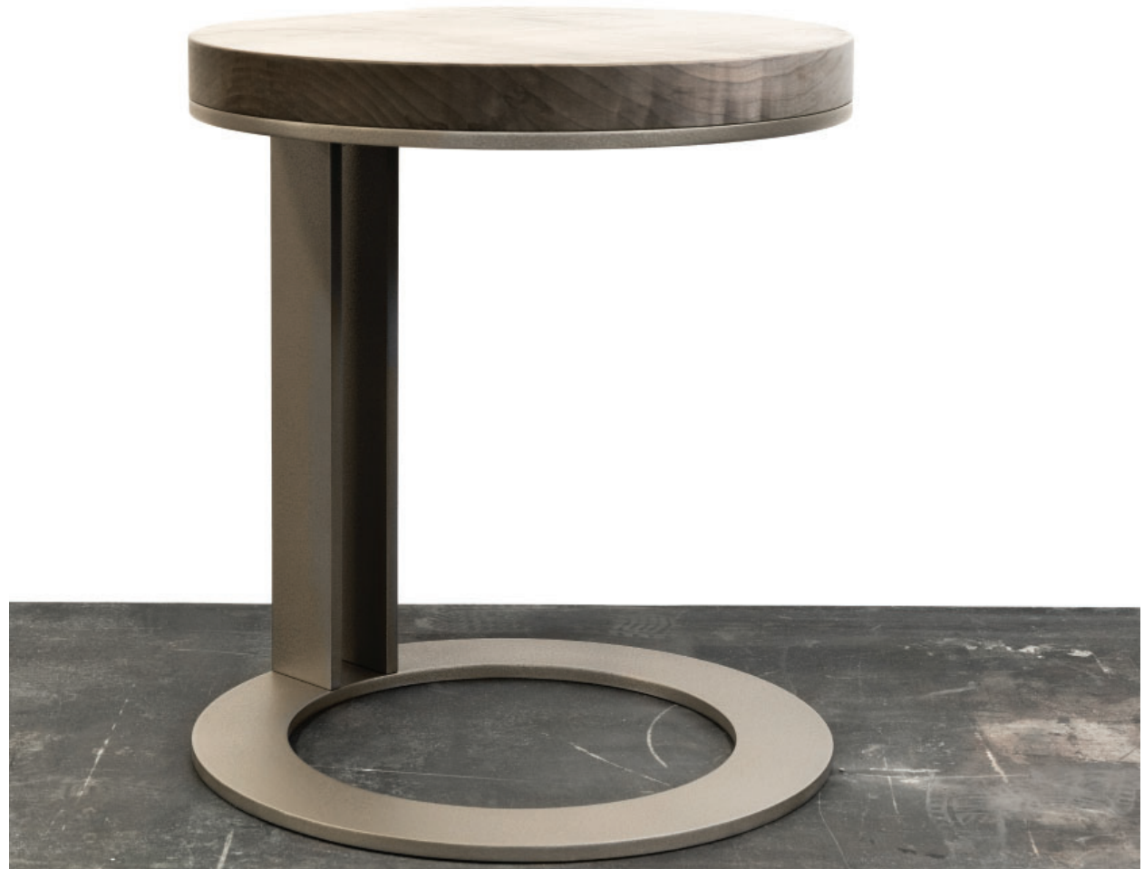
Shown in Ebonized Maple Hardwood & Nickel Quartz